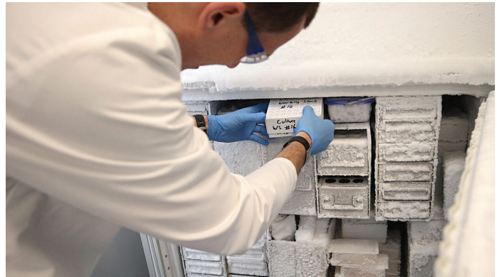
Low Temperature Conditions