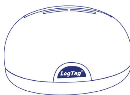
LTI HID Not Included