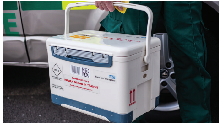
Blood & Organ Transport