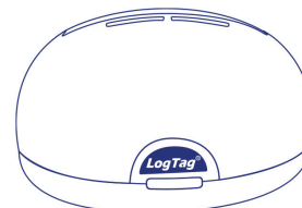
LTI WiFi Not Included